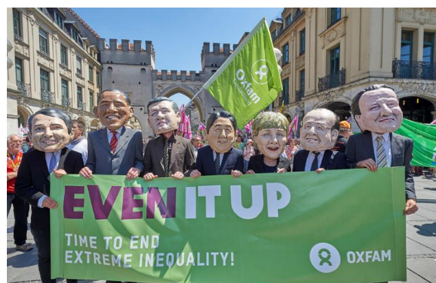
Oxfam Big Heads at the G7 Elmau 2015

Another advantage of the C7 process is the actual Summit itself. The event will be attended by the host government, either at a head of government or head of ministry level, allowing for opportunities to meet with government delegates and, possibly, presenting an issue directly to the decision-makers in government. Occasionally, the media will attend the C7 which is another opportunity to raise awareness of an issue and a policy solution or initiative.